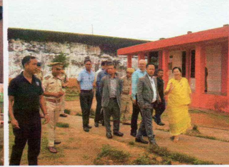
Inspection inside the Jail premises by Home Minister and D. G. Prisons, Meghalaya