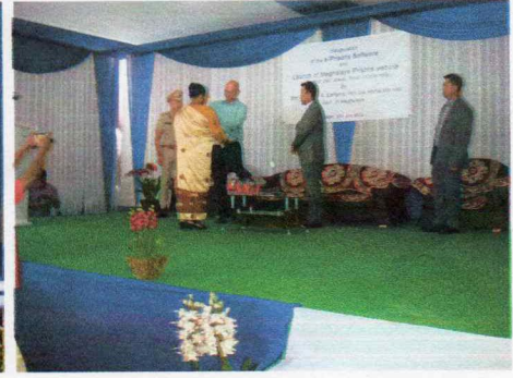
Presentation of Traditional Khasi Ryndia Tlem to the Chief Guest by D. G, Prisons