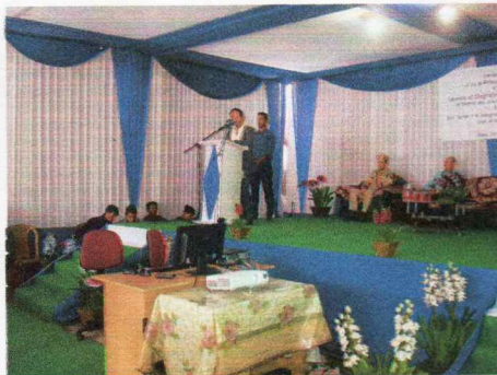
Speech by Chief Guest, (Hon'ble Home Minister) Shri James P.K Sangma