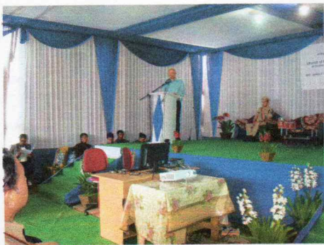
Speech by Director General of Prisons Meghalaya