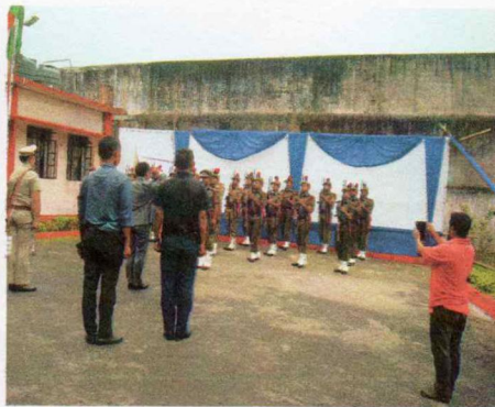
Guard of Honour