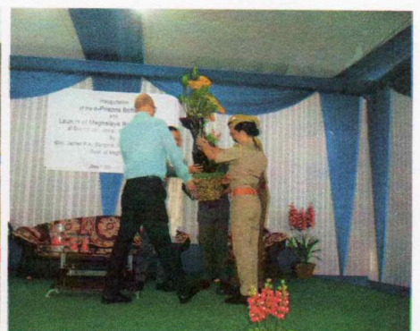
Presentation of Memento to the Chief Guest