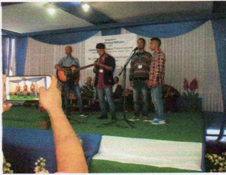
Song Performed by the Inmates, of District Jail Jowai